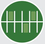
PARKING LOT LIGHTING

The EG Series provides a durable solar lighting solution in a sleek, self-contained package. The integrated system offers exceptional lighting quality for outdoor applications.