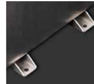
Robust enclosure mounting points