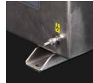
External earthing stud on the enclosure