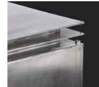
Ventilated lid construction